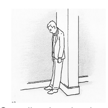
Standing leaning back